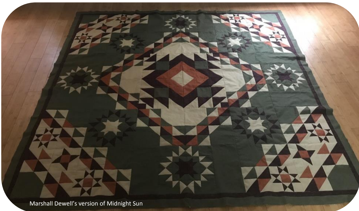
Marshall Dewell's version of Midnight Sun