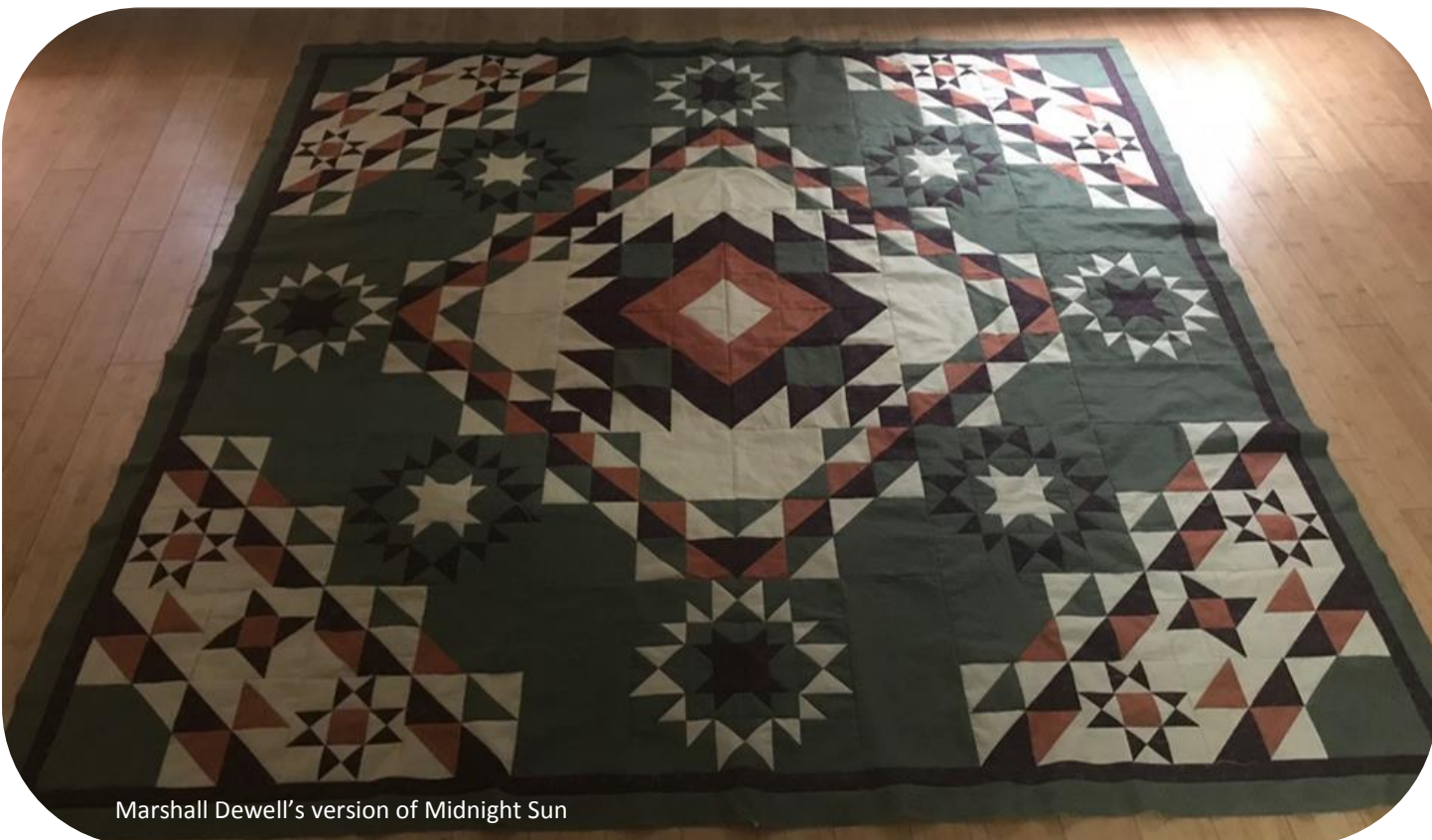
Marshall Dewell's version of Midnight Sun