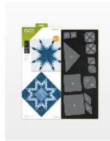
Feathered Star 16" finished block