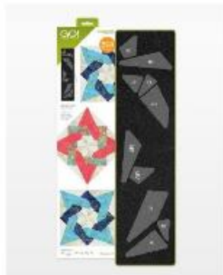
Tangled Star 10" finished block

We have 3 new Block-On-Board AccuQuilt Die. They will be available at the January Sit and Sew on January 14th .