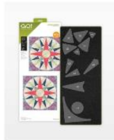
Mariner's Compass 12" finished block